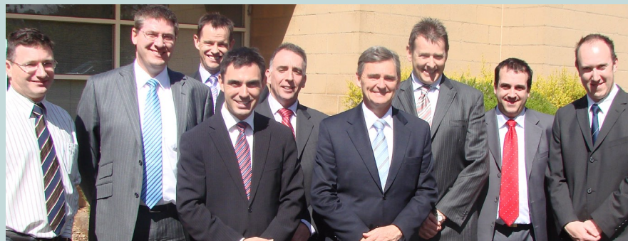
Water Minister Tim Holding, Victorian Premier John Brumby and local MP Martin Pakula with Qenos officials.

"Qenos has already reduced its water use by more than 30 per cent through water efficiency and recycling and by end of 2010, will slash it's water use by 90 per cent." Mr Holding said.